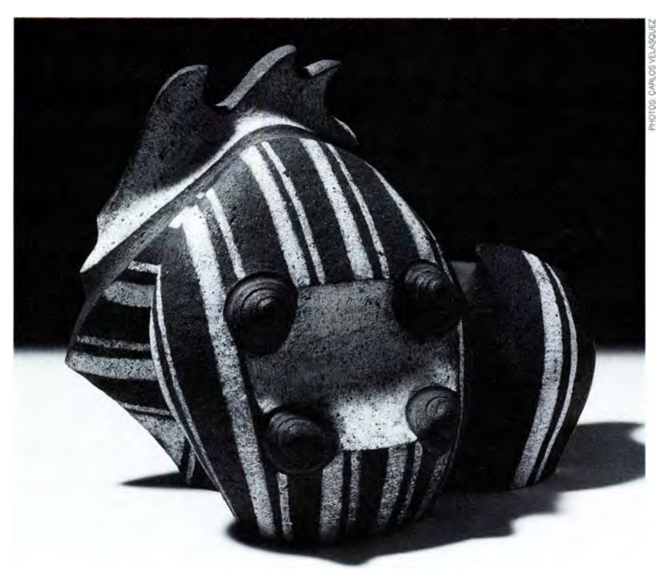
Untitled sculpture in two sections, approximately 16 inches high, stoneware and local clay, with slip and incising, bisqued, reduction fired twice to 1250°C (2282°F), $1500.