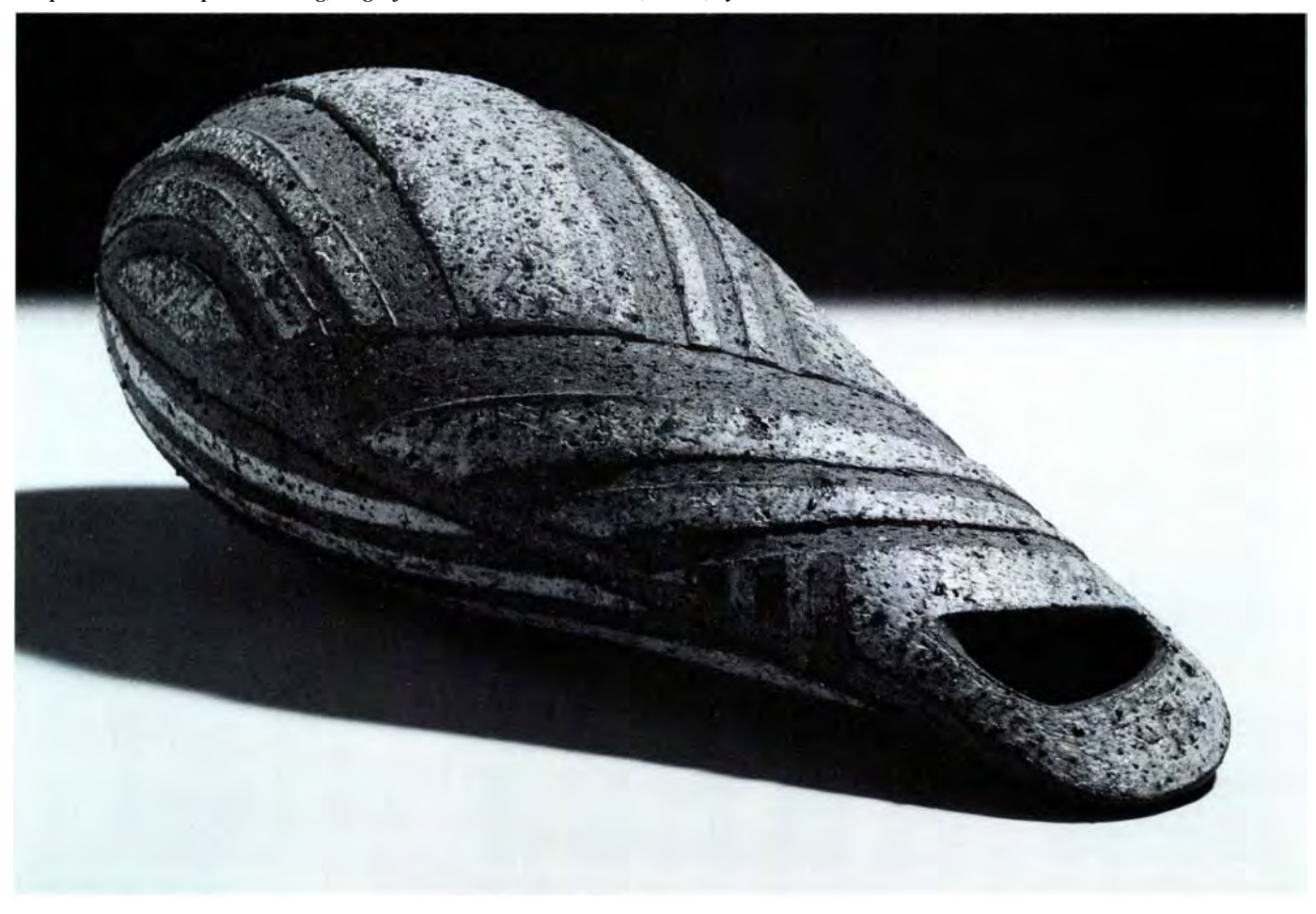
"Vessel Object," approximately 19 inches in length, coiled and paddled stoneware/local clay, patterned with slip and incising, single fired in reduction to 1250°C, $1500, by Carlos Runcie Tanaka.